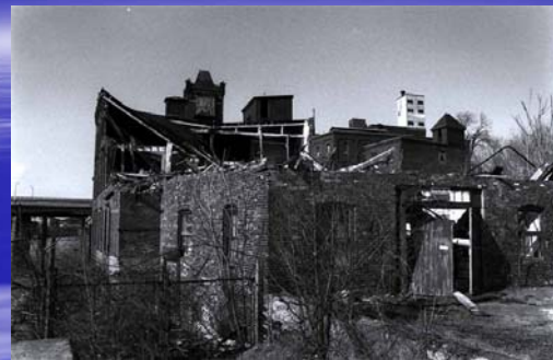
Eastside South - 1990's