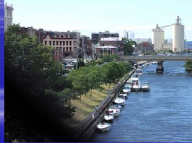
Oswego Riverwalk West downtown in 2007