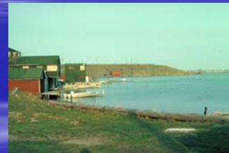
Wright's Landing - fishing shanties and bathhouses before marina was built