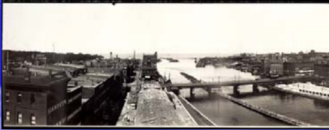
Oswego West Riverfront in Downtown Oswego before 1950s