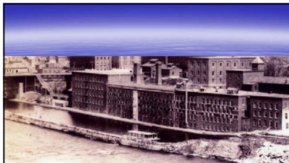
Eastside South Early 1900's